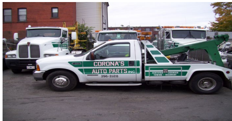
NEED A DEMOLITION DERBY CAR, CALL CORONA’S AUTO PARTS & TOWING 1-800-842-0021

TROPHIES SPONSORED BY: “CORONA’S AUTO PARTS & TOWING” www.CoronasAutoParts.com