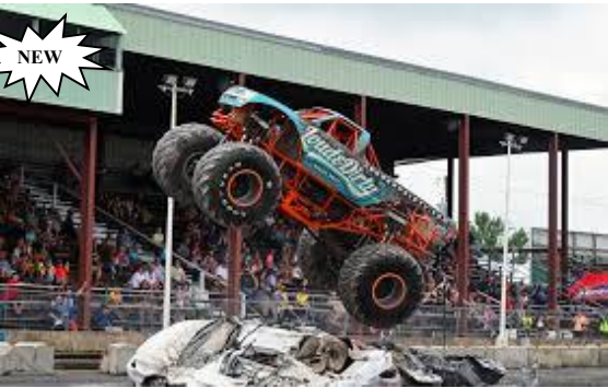
Entry Information Brochure