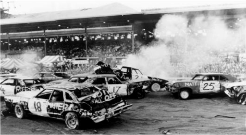
WORLD'S LARGEST DEMOLITION DERBY

J M PRODUCTIONS, INC 4751 SOUTHWESTERN BLVD. HAMBURG, NY 14075-1926 (716) 648-5100