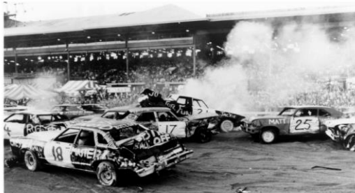
WORLD'S LARGEST DEMOLITION DERBY

J M PRODUCTIONS, INC 4751 SOUTHWESTERN BLVD. HAMBURG, NY 14075-1926 (716) 648-5100